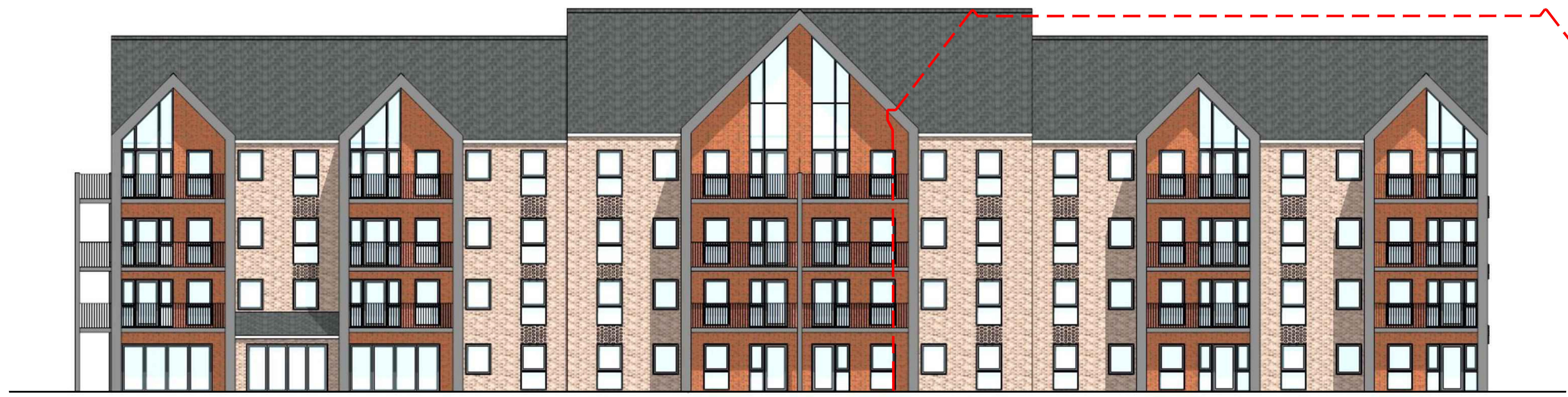
BLOCK A - SOUTH ELEVATION