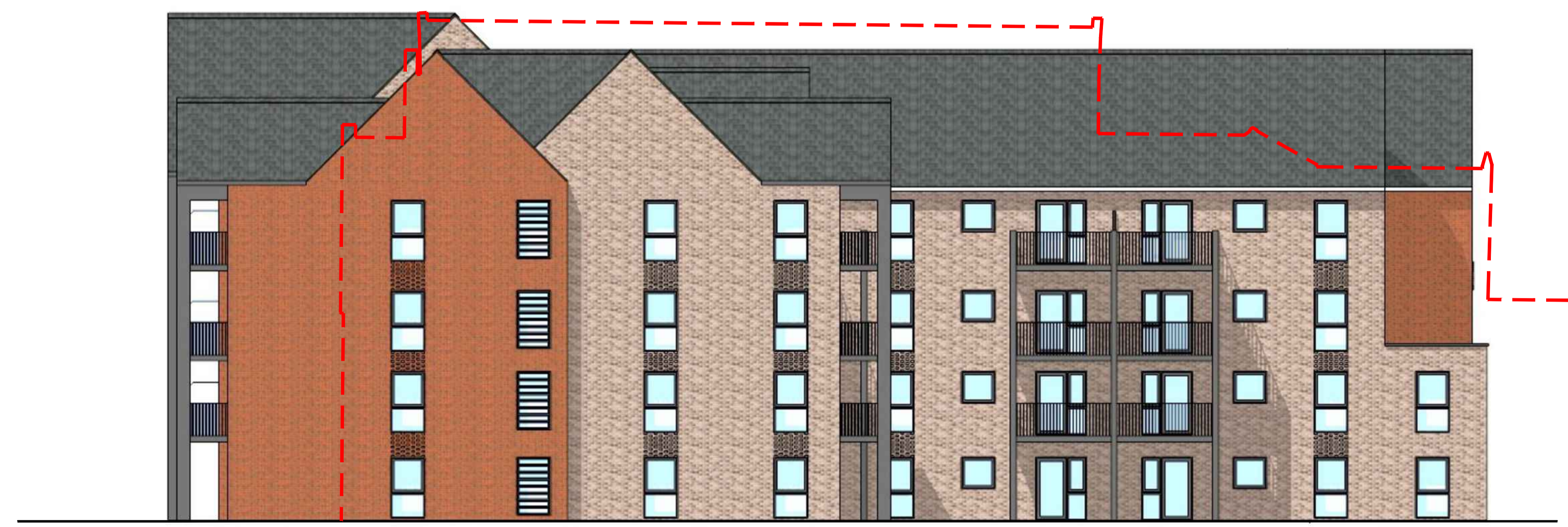
BLOCK A - EAST ELEVATION